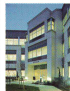
Cover: North Creek Technology Campus Phase III Building L entry at sunrise.